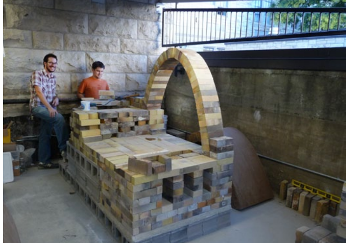
Top left: Figure 6. The soda kiln's intake and exit ports were built oversized and to standard size brick dimensions for easy modification of the burners.