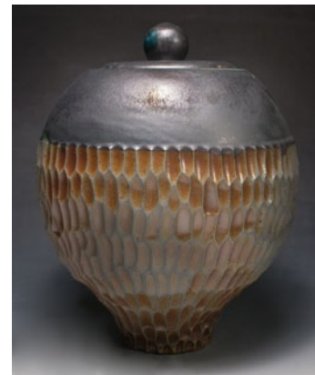
Top: Figure 4. Jarred Pfeffer. Bulbous. 2011. 6 x 7 x 7 in. (15 x 17 x 17 cm.) Fired to cone 6 (1200°C), soda fired stoneware.